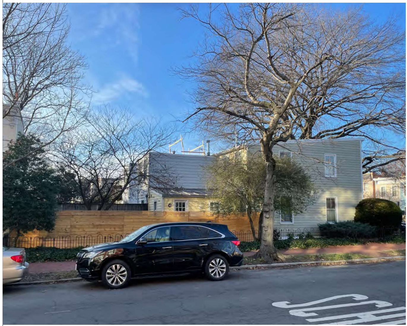
1 Existing view from 10th St. SE (Lumber Mock-Up Shown) A-114 SCALE: 1:3.25

SIEMER RESIDENCE 921 G St. SE Washington DC 20003