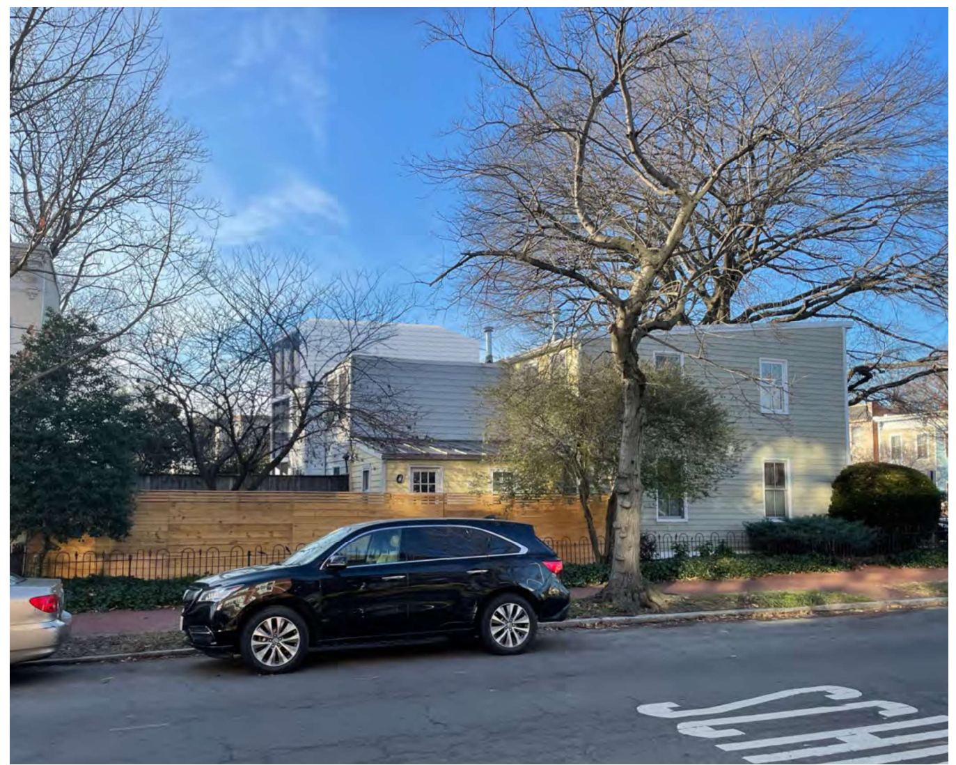
1 Proposed View from 10th St. SE A-114 SCALE: 1:3.27