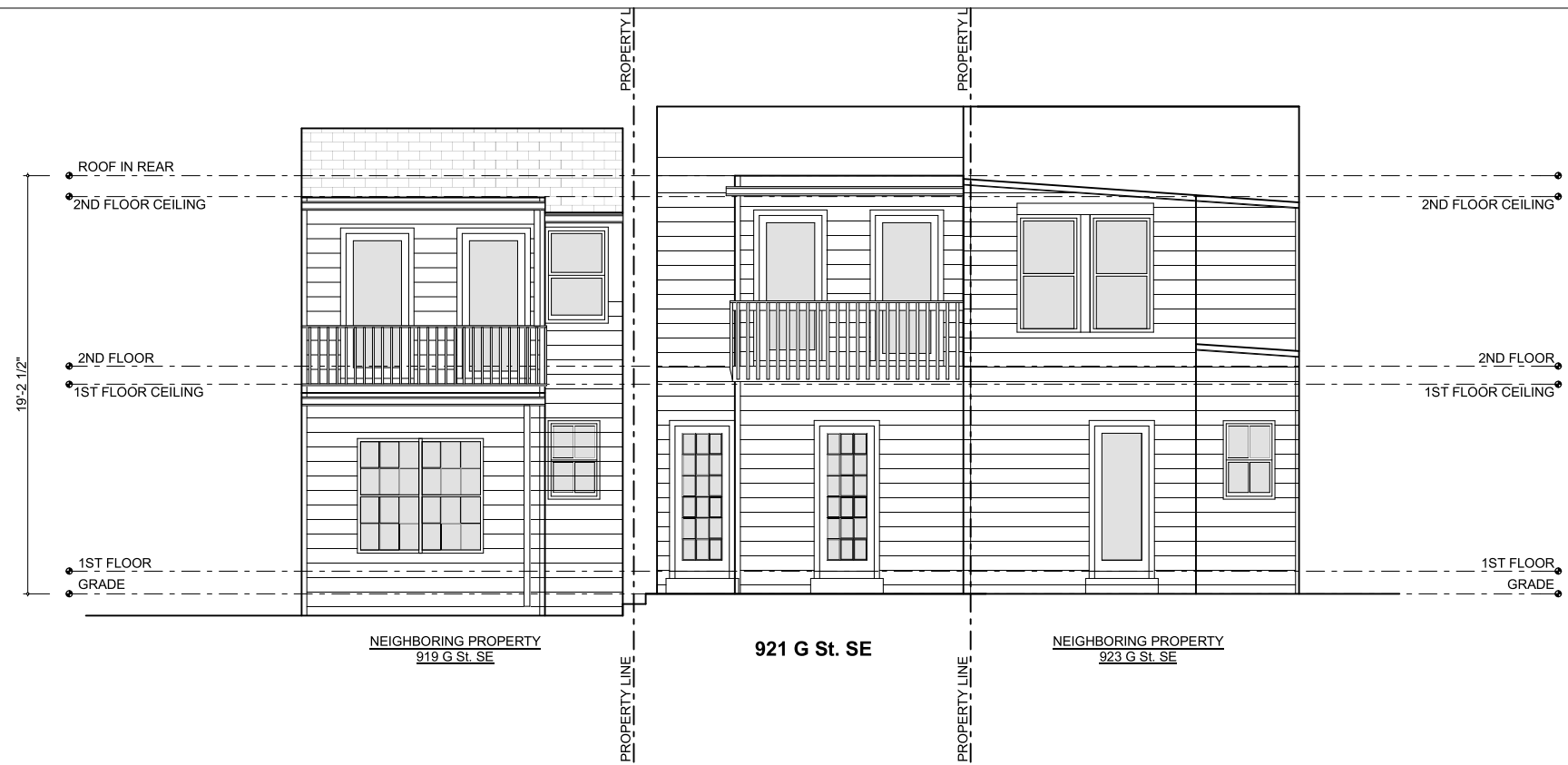
1 A-112 Rear Elevation: Existing SCALE: 1/4" = 1'-0"