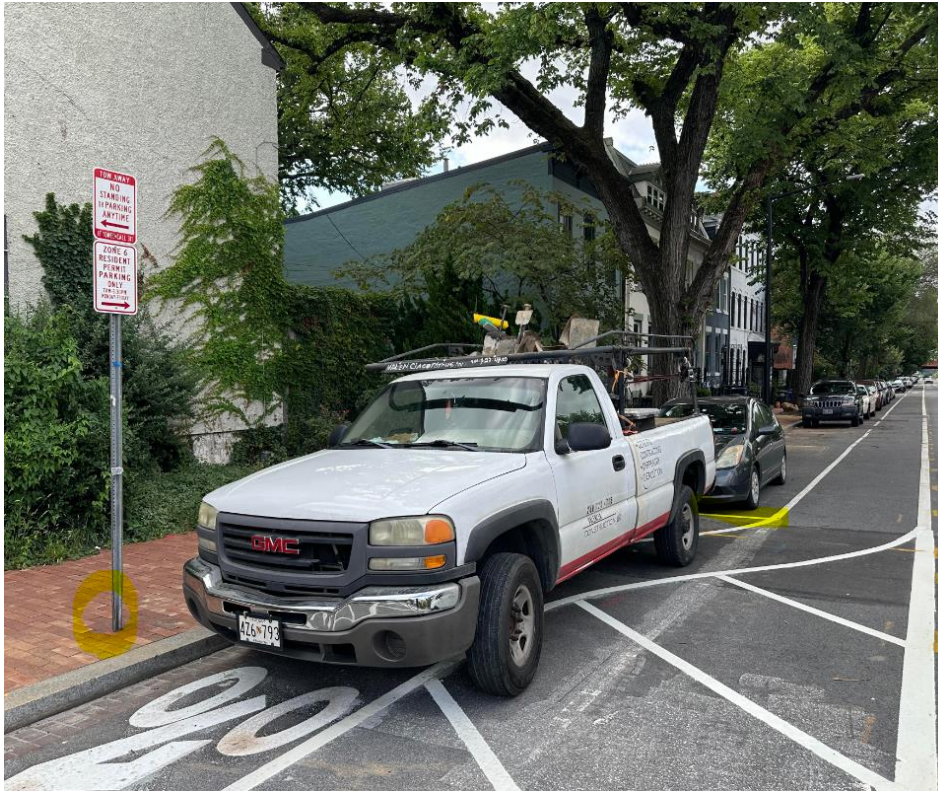
Photo of east side of 700 block 11 th Street, SE before the G Street intersection. Bike lane markings have been altered, but No Parking signs have not been moved – so parked cars are blocking the revised bike lane markings, forcing cyclists to move into unprotected lanes. This incomplete modification has increased safety risks to cyclists and pedestrians at this intersection. Each NOIs identifies 4 revisions to the parking spaces and signs and none have been executed.